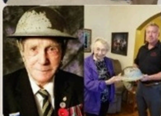
We accept all donated militaria